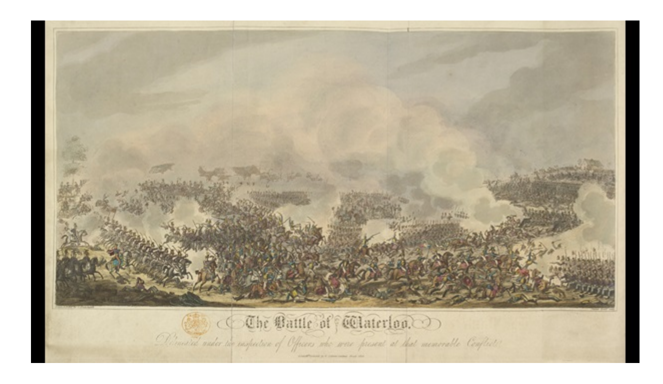
Illustration of the Battle of Waterloo

The Battle of Waterloo (1815) marked the end of the Napoleonic wars, which, with the French Revolutionary wars, had occupied the European powers for over 20 years. This illustration is by George Cruikshank.